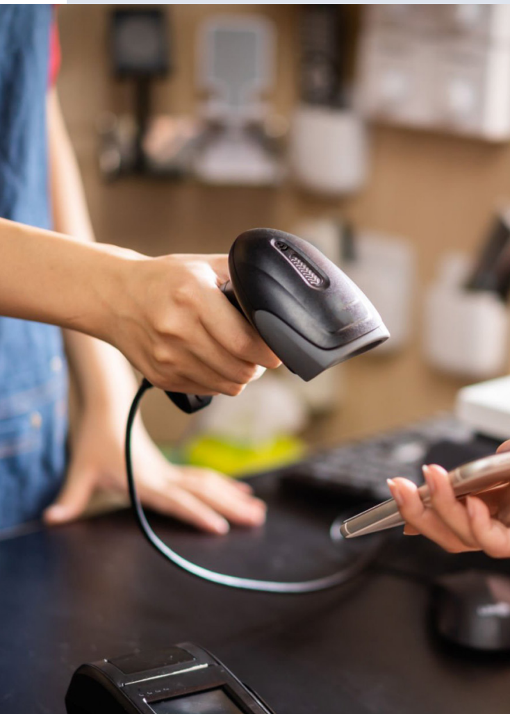
Physical or digital – full integration with POS